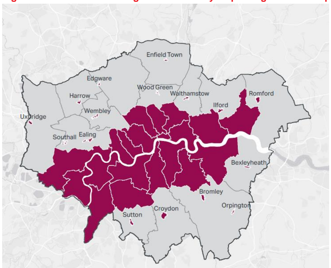
Figure 10.2 - Areas where higher minimum cycle parking standards apply