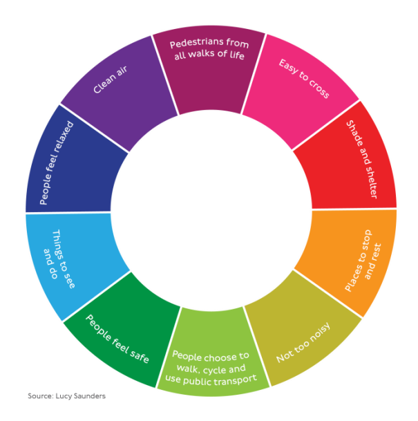
Figure 10.1 - The Ten Healthy Streets Indicators

10.2.8 The Mayor has a long-term vision to reduce danger on the streets so that no deaths or serious injuries occur on London's streets. This Vision Zero will be achieved by designing and managing a street system that accommodates human error and ensures impact levels are not sufficient to cause fatal or serious injury. This will require reducing the dominance of motor vehicles and targeting danger at source.